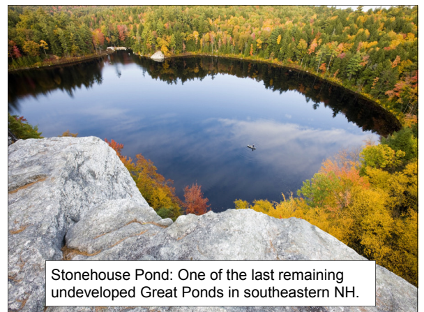
Stonehouse Pond: One of the last remaining undeveloped Great Ponds in southeastern NH.

The Trust for Public Land (TPL) is working with the Town of Barrington and Strafford Rivers Conservancy to complete the Stonehouse Pond Conservation Project – a collaborative effort to protect 250 forested acres surrounding Stonehouse Pond in Barrington. This stunning property features a mix of woodlands, wetlands and open waters that have been recognized as a conservation priority in the NH Wildlife Action Plan, the Land Conservation Plan for NH's Coastal Watersheds and Barrington's natural resource inventory. The jewel of the subject property is Stonehouse Pond itself, surrounded by trees and towering cliffs; one of the last remaining undeveloped Great Ponds in southeastern New Hampshire. The pond is a regional fly fishing hotspot that attracts anglers from miles around seeking its solitude, beauty and abundant stocks of brook trout.