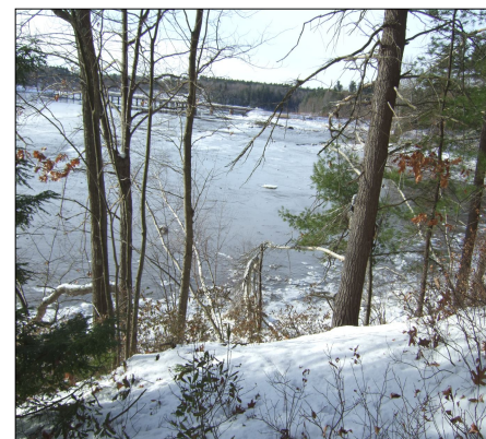
View of the Salmon Falls River from the Franklin Preserve.